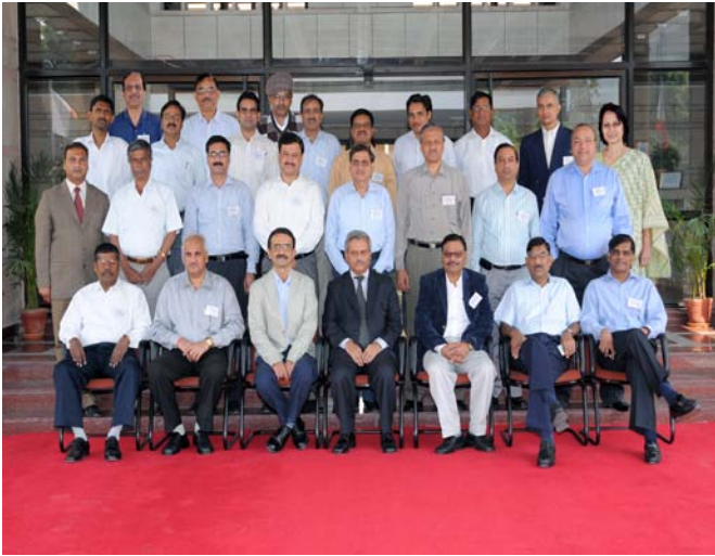
Group Photograph of Course on “IT Management and Governance” for IAS Officers held during 26 th to 30 th October, 2009.

iCISA organizes some courses for other Government departments as well. The courses framed during 2010-11 are: